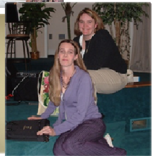
Sweet ladies at Northside, Lebanon, acted out "Happily Ever After."