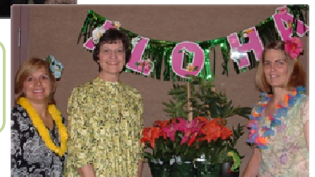
West Jefferson enjoyed a Luau.