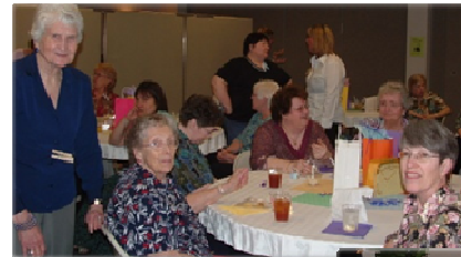
Ladies gathered at FBC Centralia, MO

Sending cards of encouragement still ranks high in the ministry of Giving Thanks. Added to that is our distributing of "For Your Journey." We have received positive feedback from across our nation!! Please read it and ask for more if you have an opportunity to minister with it. I wish I had room for pictures from every event. Since that's not possible, here are a few.