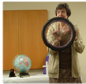
Don't you wish you knew what I'm saying here?